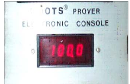
ELECTRONIC TESTING CONSOL