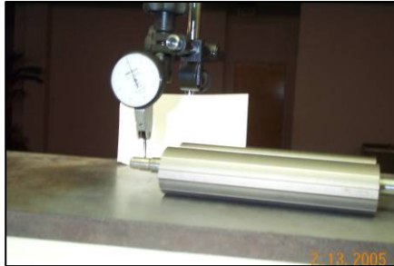
IMPELLER STRAIGHTNESS CHECK